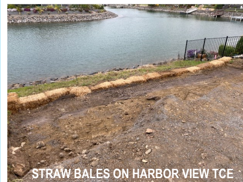
STRAW BALES ON HARBOR VIEW TCE

prepared to continue with this directive for future developments on the Franklin Island. We commend Council for this action and remind residents that Council action is likely on valid concerns if they are reported.