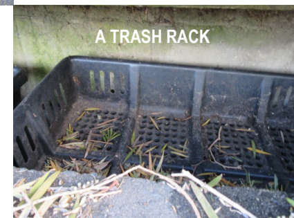
A TRASH RACK

Fundamental to this process is the need to empty the trash racks on a regular but flexible cycle. Particular attention is required after heavier rain