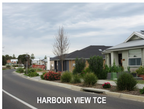
HARBOUR VIEW TCE