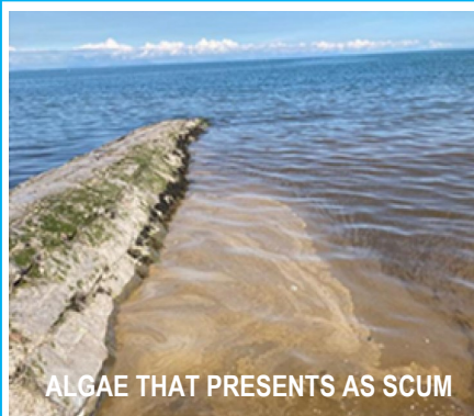
ALGAE THAT PRESENTS AS SCUM

The backflush has successfully dislodged mussels from the pipe and provided visual evidence of this success in close proximity to the outlet pipe. The presence of shells at this point is a cheap and effective indication that flushing continues to be successful.