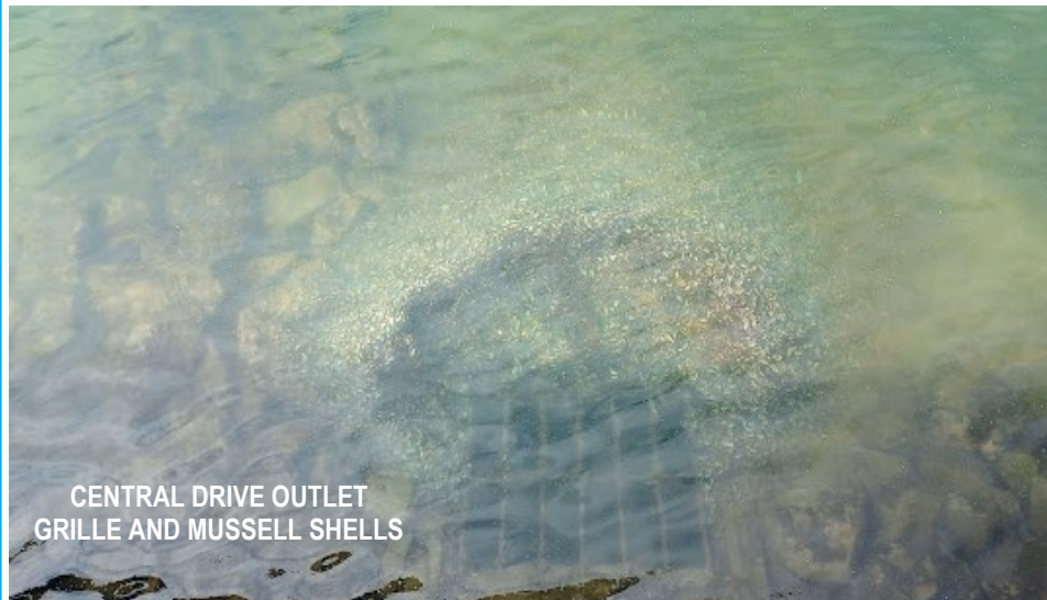
CENTRAL DRIVE OUTLET GRILLE AND MUSSELL SHELLS

Sorry about taking up so much space with this image but it's difficult to interpret it if the size was any less. This is a photo of the grille over the outlet pipe from the Franklin Lake and was taken from the Central Drive bridge.