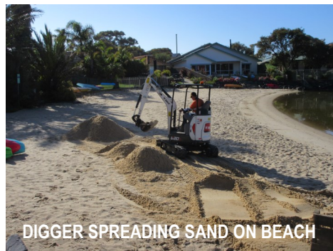
DIGGER SPREADING SAND ON BEACH

Council also installed a temporary conveyor belt from the driveway, and through the garage to the