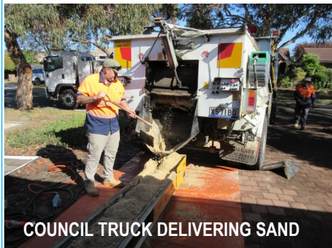
COUNCIL TRUCK DELIVERING SAND

had already been sold and houses constructed. This created a problem when the Ketch Place beach needed additional sand. The solution in millenium years was to crane a barge into the lake and deliver the sand and a bulldozer by water.