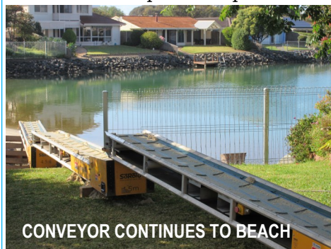
CONVEYOR CONTINUES TO BEACH

edge of the beach. From there, the digger spreads the sand to areas of the beach where the sand level has diminished.